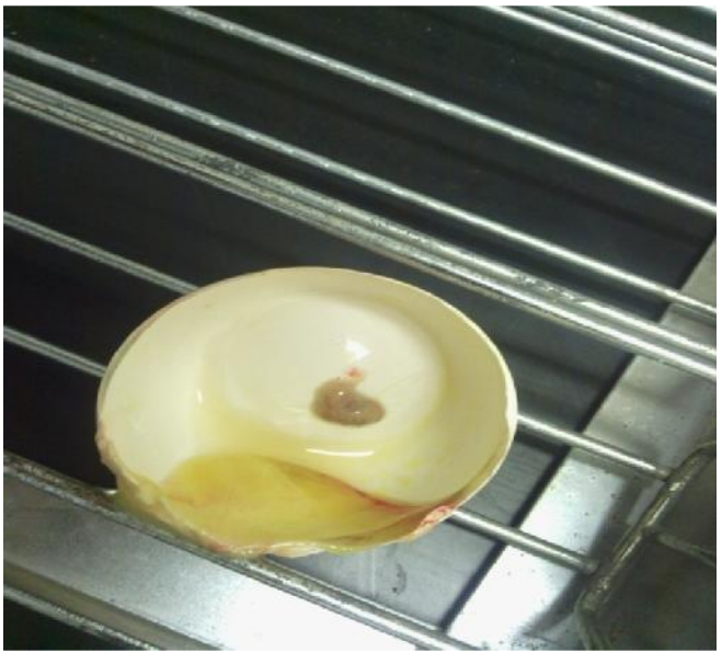
Figure 3. Mortified embryo on the 7<sup>th</sup> day of incubation