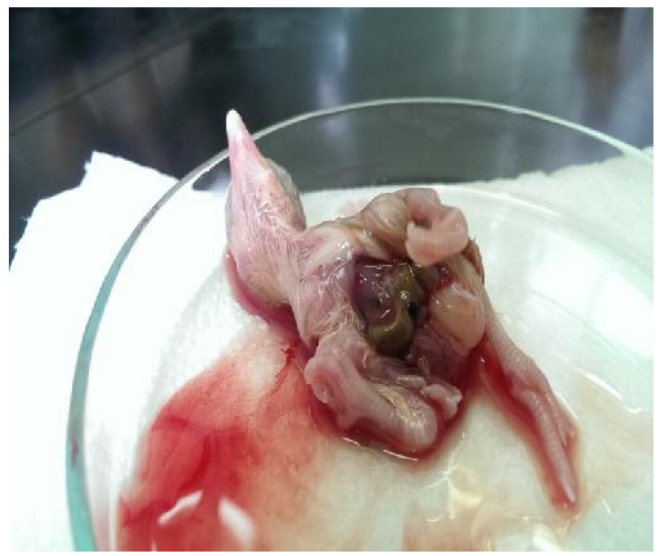
Figure 4. Mortified embryo with open chest cavity on the 18<sup>th</sup> day of incubation

Similarly to previous results (Juhász et al. , 2006; Szabó et al. , 2011), according to the pathological studies it was established that individual treatments with cadmium sulphate significantly increased the embryonic mortality. The herbicide Fozát 480 in individual and combined administrations significantly increased the embryonic mortality. The rate of malformations remained at a low level in all treated groups, so teratogenic effect could not be proved. Teratogenic effects of different doses