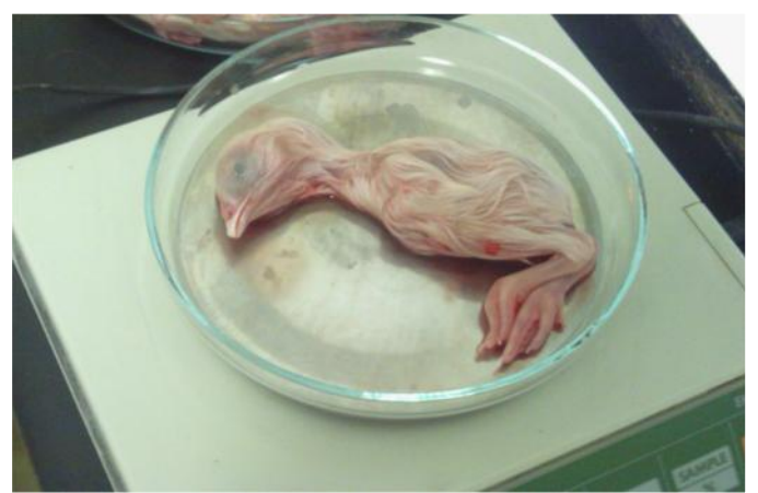
Figure 2. Chicken embryo on the 19<sup>th</sup> day of incubation

Figure 1. Data of embryonic body weights in the avian teratological test of individual and joint toxic effect of Fozát 480 (480 g/l glyphosate [isopropylamine salt]) and cadmium sulphate performed with injection treatment method.